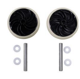
Replacement Wheel Kit 300456