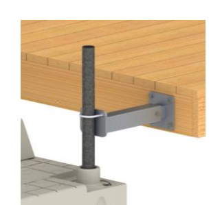
Telescoping Port to Fixed Dock Kit (Adjusts from 41 to 61 cm) 301434 - Fits 2" Pipe 301435 - Fits 4" Pipe