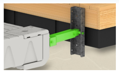
Alu. Extension Arm Kit 301436 - Adjusts from 41 to 61 cm (2qty) Use for EVO series part no. 301360