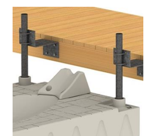
Port to Fixed Dock Attachment Kit 301281 - Fits 2" Pipe 301282 - Fits 4" Pipe