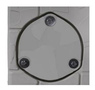
EVO Sport Bolt-in Cap 301514