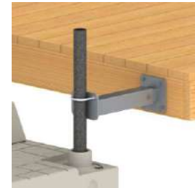
Telescoping Port to Fixed Dock Kit (Adjusts from 41 to 61 cm) 301434 - Fits 2" Pipe 301435 - Fits 4" Pipe