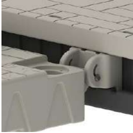
EVO to Wave Dock Attachment Kit 301347