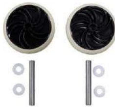
Replacement Wheel Kit 300456