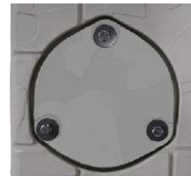
EVO Sport Bolt-in Cap 301514