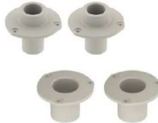
Pipe Sleeves 300103 - 2" Raised 301011 - 3" Flush 300041 - 4" Flush