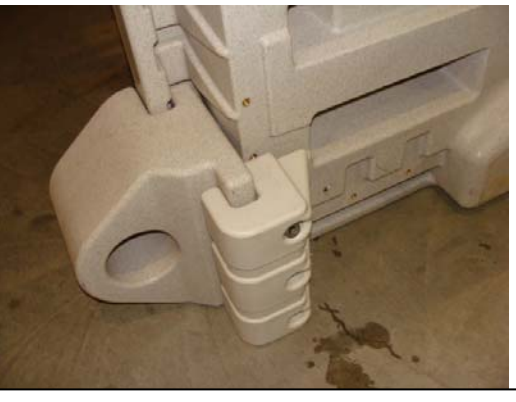
C-clamp bolted into place at Port front