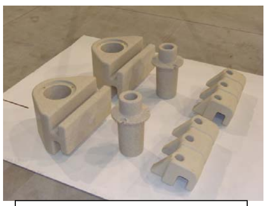
Side Post Attachment Kit