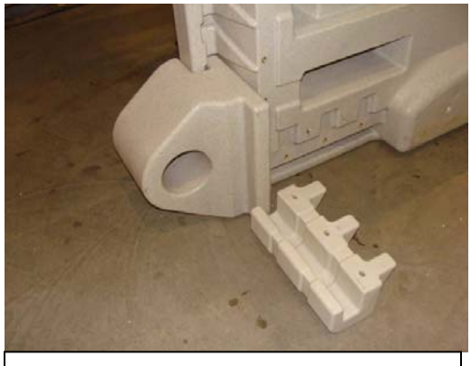
Post Attachment & 24" C-Clamp