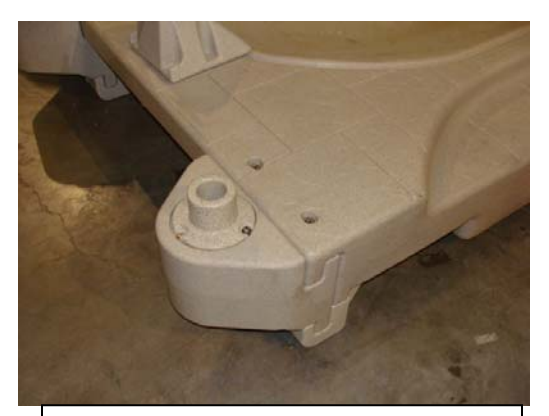
Pipe Adapter bolted in place