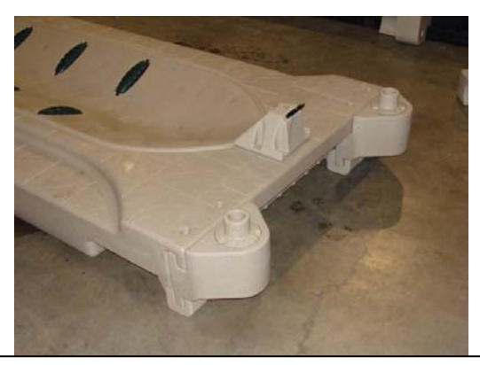
Wave Port with two Post Attachments at the front