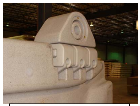
Post attachment bolted into place at the side rear position