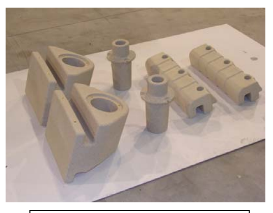
Front Post Attachment Kit