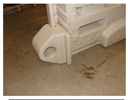
Post attachment at front of Port