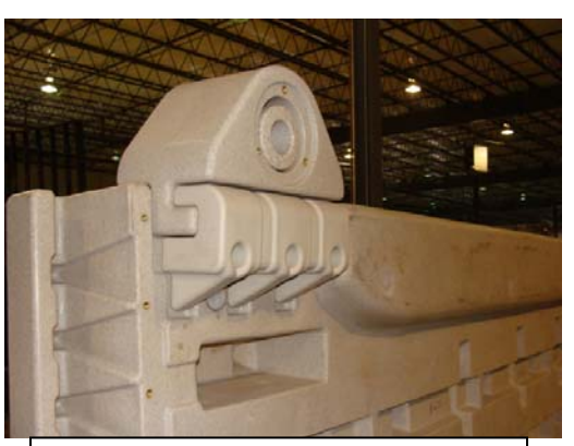
Post Attachment bolted into place at the side front position