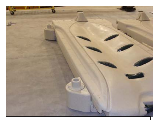
Port with two Side Post attachments