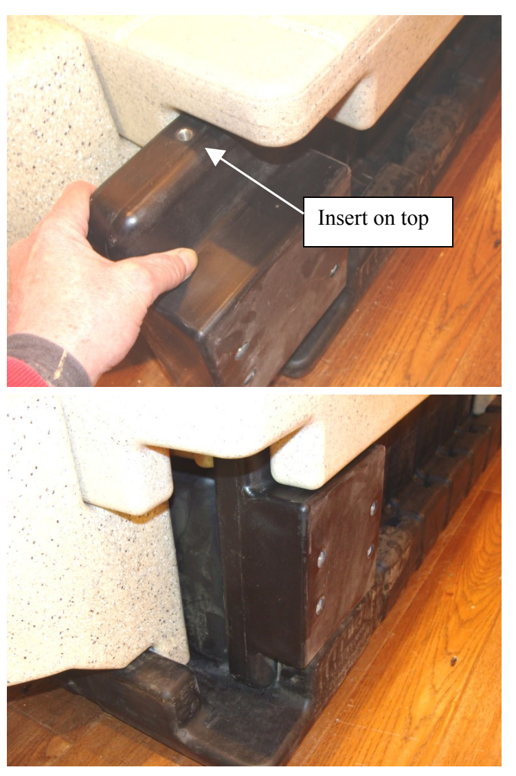
Plastic plate slid into channel on Wave Armor Dock.

1. Slide accessory plate into the channel on the dock. Make sure the insert is on the top.