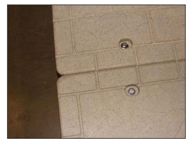
H-Beam Bolted into Dock Sections