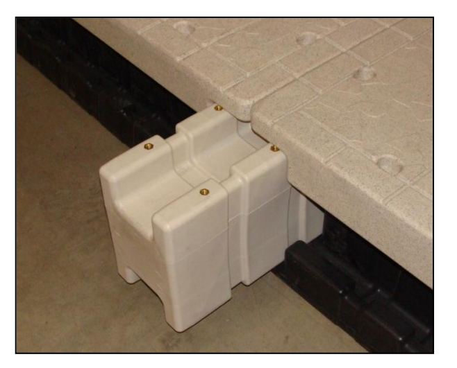
H-Beam Sliding into Channels of Dock Sections