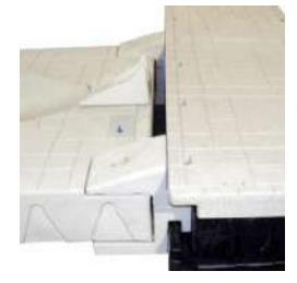
SLX to Wave Dock Attachment Kit 300998